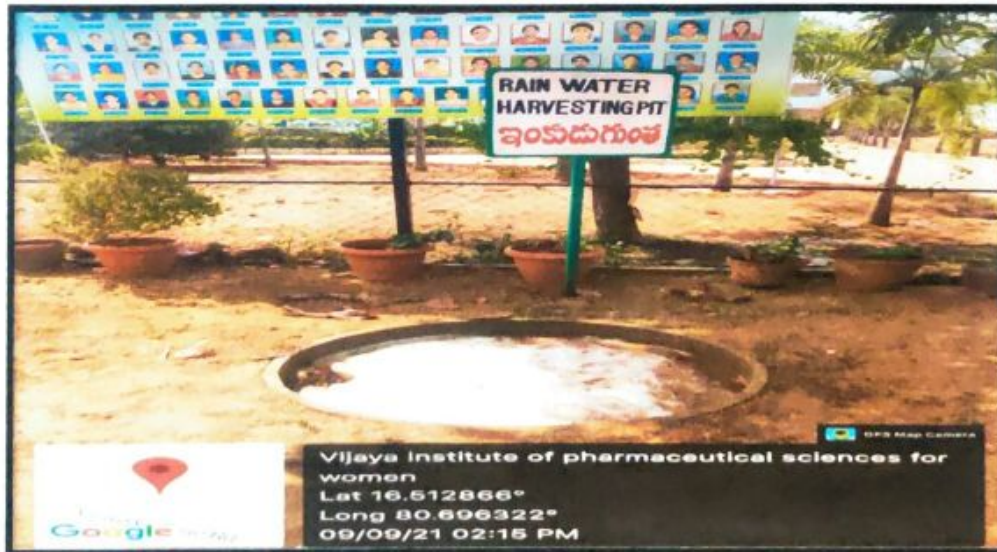
Rain Water Harvesting Pit