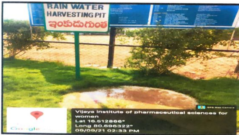
Rain Water Harvesting Pit