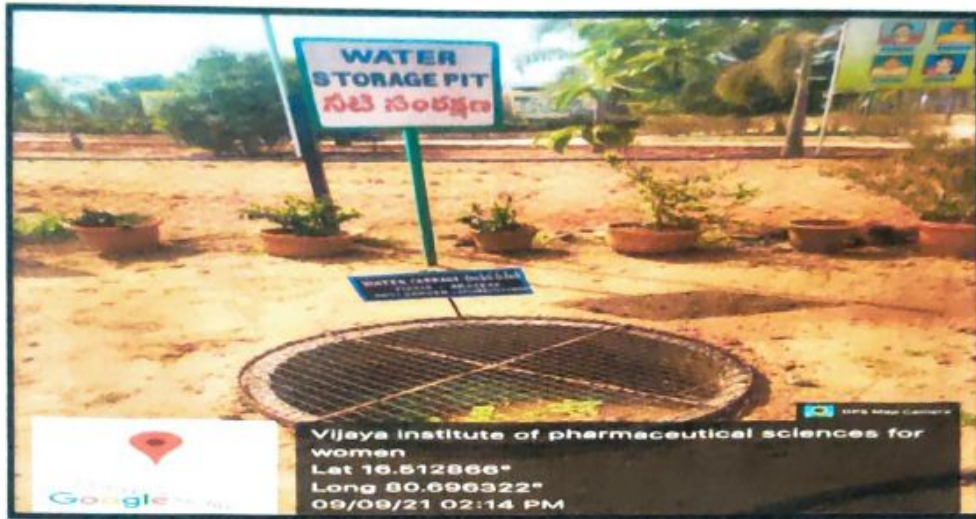
Water Storage Pit