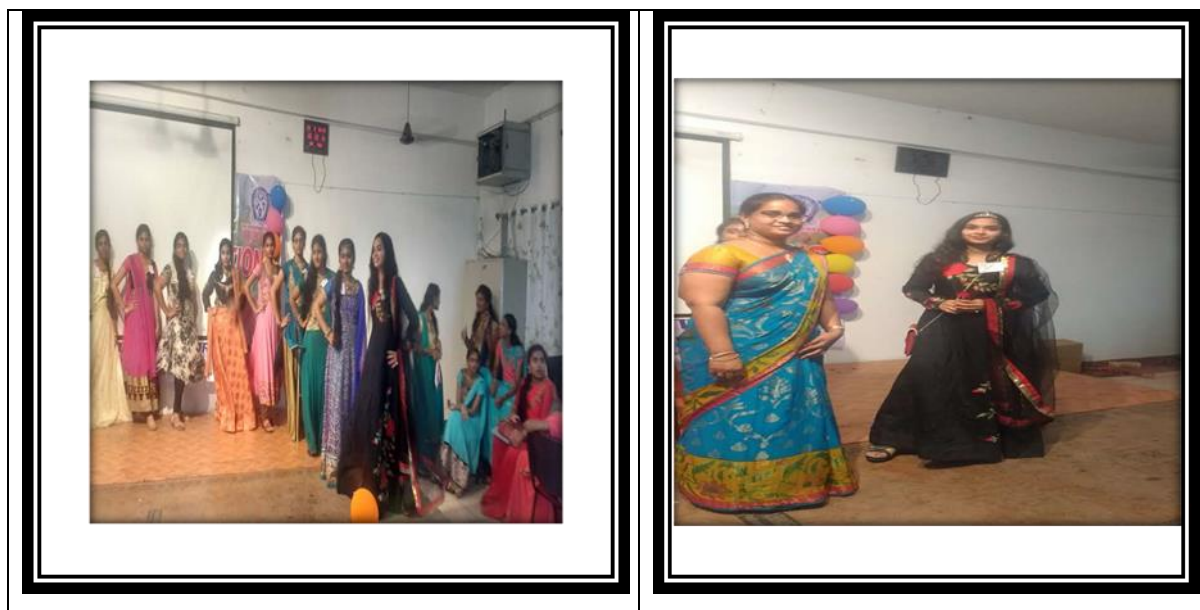
Figure 1 Fresher's Day Celebrations