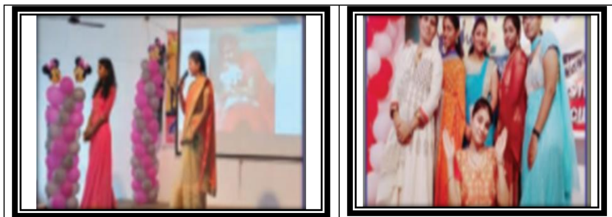
Figure 21 Farewell Day

VIPW. She felt happy about the achievements and accomplishments of the students in the campus and wished them a happy life ahead with bright career. Later third year B. Pharm students and Pharma D students have played a video clip for final year students in which all the memories of students were recalled. The programme was followed by singing and dance performances by the juniors. The juniors also conducted fun games to the seniors and created ambience of enjoyment and fun. The senior students shared their views and experience about the college. Finally, Principal and the faculty members wished good luck to the final years in their future endeavours. Students some of them as they shared their moments spent in the college, fell into tears.