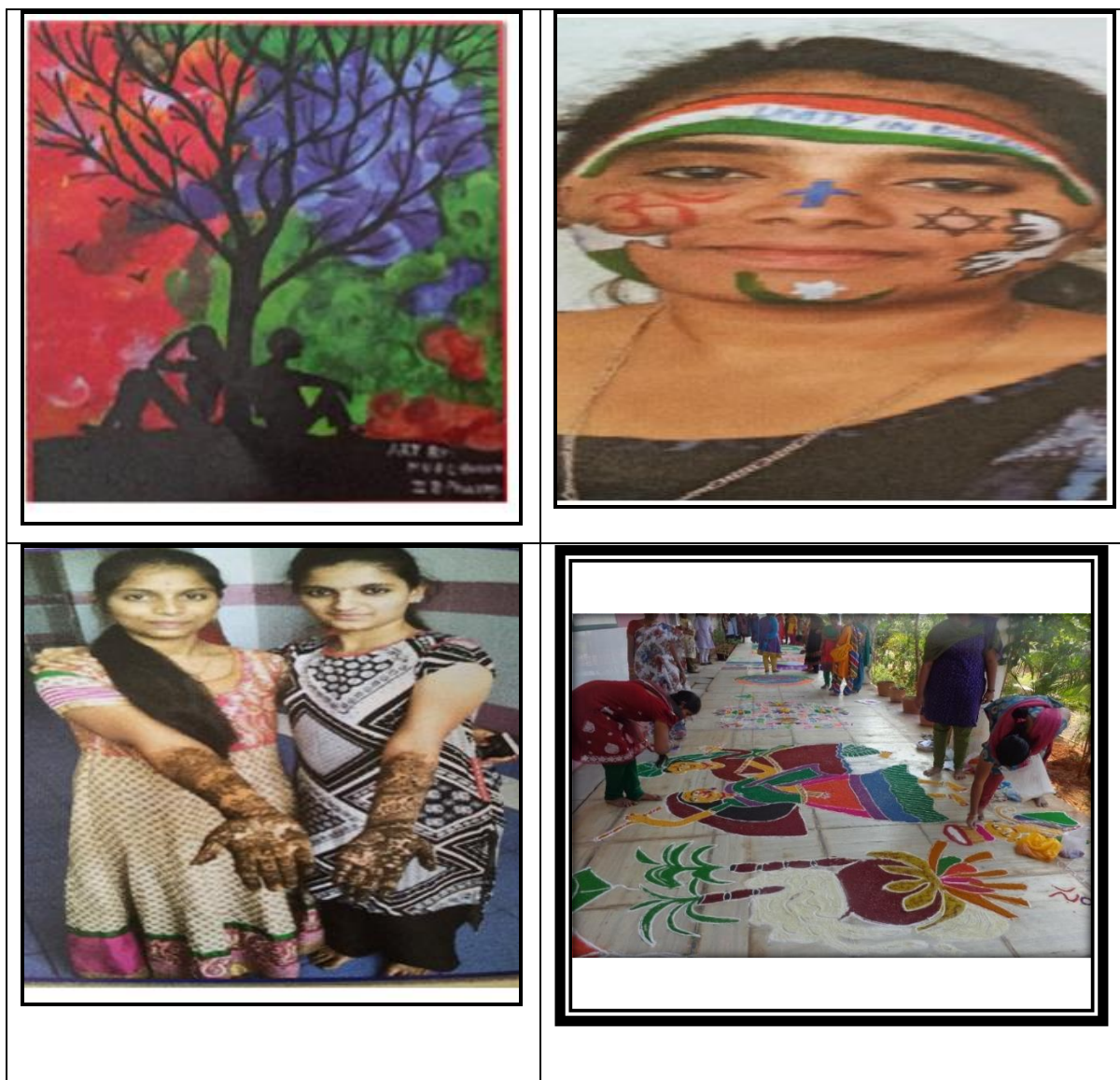
Figure 2 Sankranti Celebrations