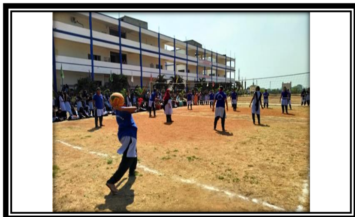
Figure 7 Throw Ball