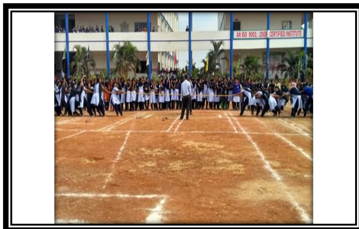
Figure 13 Tug of War