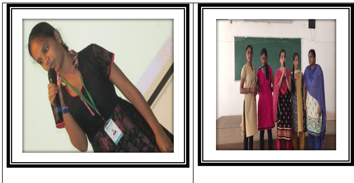
Figure 19 Solo Singing and Group Singing