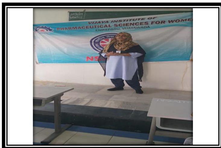
Figure 17 Pick and Speak