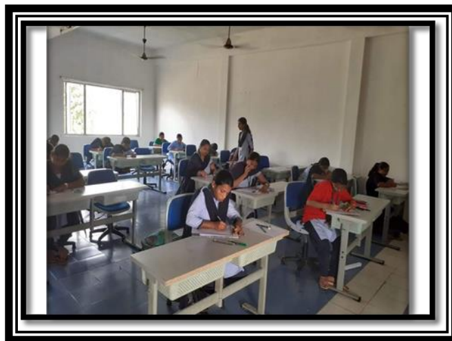
Figure 16 Essay Writing