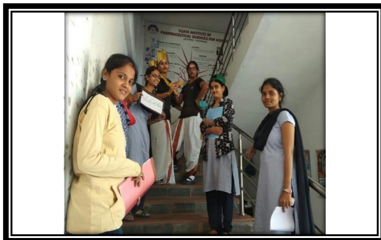
Figure 18 Skit