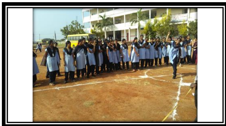
Figure 4 Shot Put