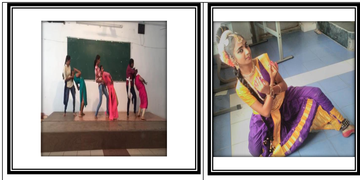
Figure 20 Solo Dance and Group Dance