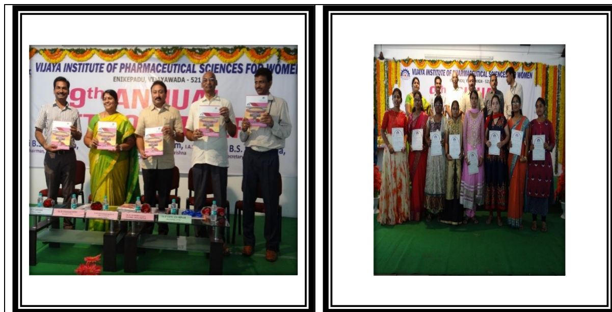
Figure 22 Annual Day Celebrations