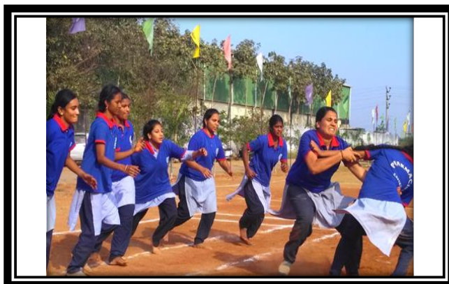
Figure 10 Kabaddi