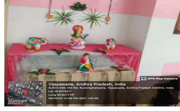
Bommala Koluvu Presentation by teams Sizzlers & Inspirers.